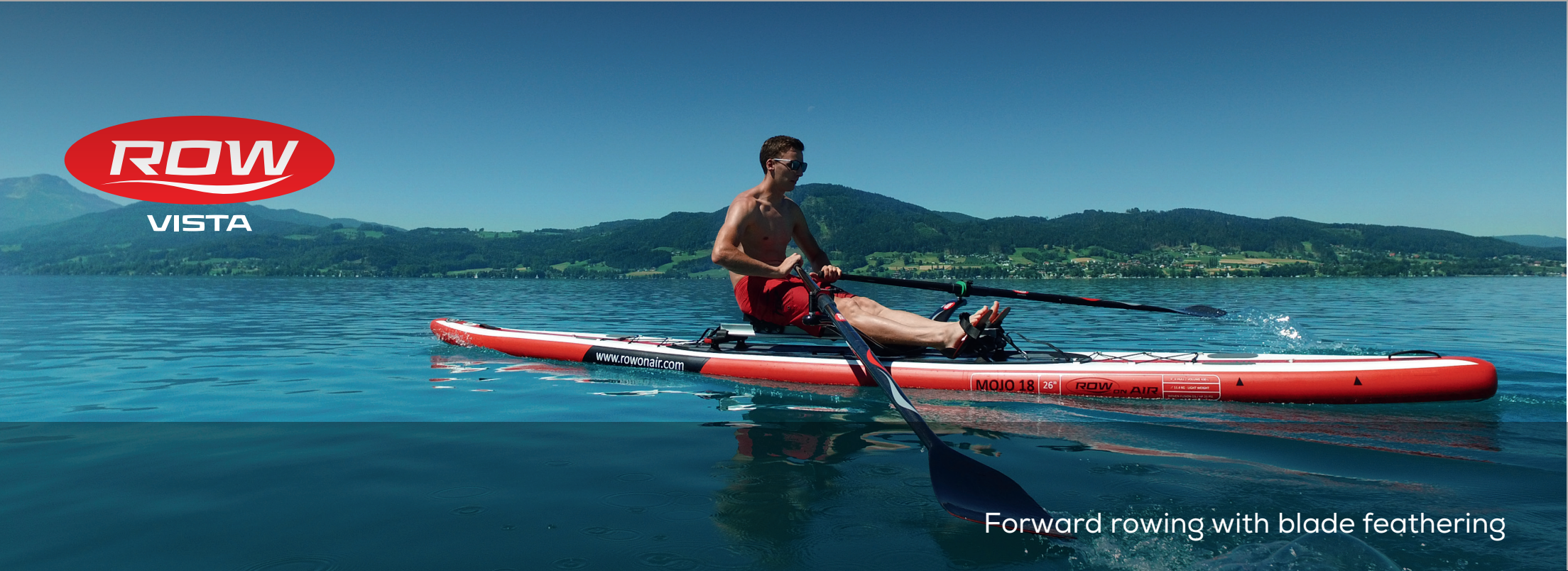
Forward rowing with blade feathering