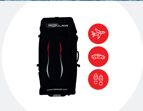
MOJO 18' with RowVista®